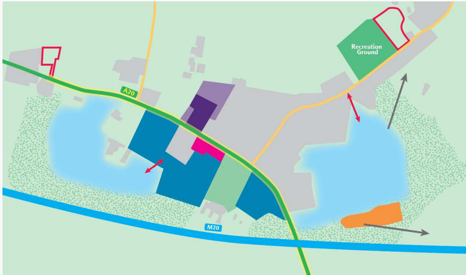
Policy CSD9 - Sellindge Strategy